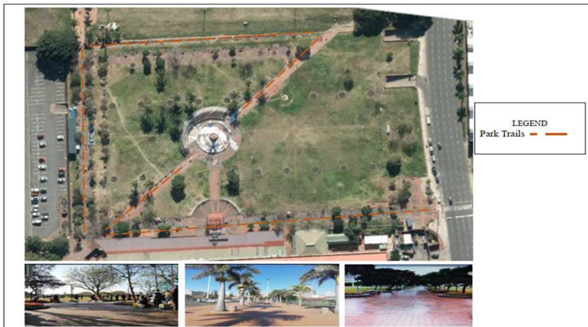
Figure 2: Aerial view and existing park trails

Although other facilities are not found, the remnant amenities are still crucial for the attraction of people to the space. The park has trees along the perimeters and the trees proffer a sense of boulevard scenery in the space. Users of the park enjoy taking photographs of the natural landscape and flowers.