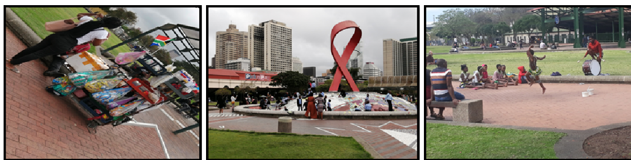
Figure 1. Various activities.

According to observations conducted over three weeks during morning hours, afternoon hours, and evening hours at Gugu Dlamini Park, it was discovered that the space is dominated by myriad activities including vagrancy, illegal trading, cultural dances as well as young adults consuming alcohol on the edges of the park. According to the eThekweni Municipality Parks and Recreational Bylaws (2015), alcohol is prohibited in the urban open space unless it is consumed in designated areas, which unfortunately are not present at Gugu Dlamini Park, and the bylaws further prohibit any form of trading without obtaining a permit from the municipality. Figure 1 shows the different activities that occur in the park and includes users of the space frequently taking pictures next to the HIV/AIDS sculpture.