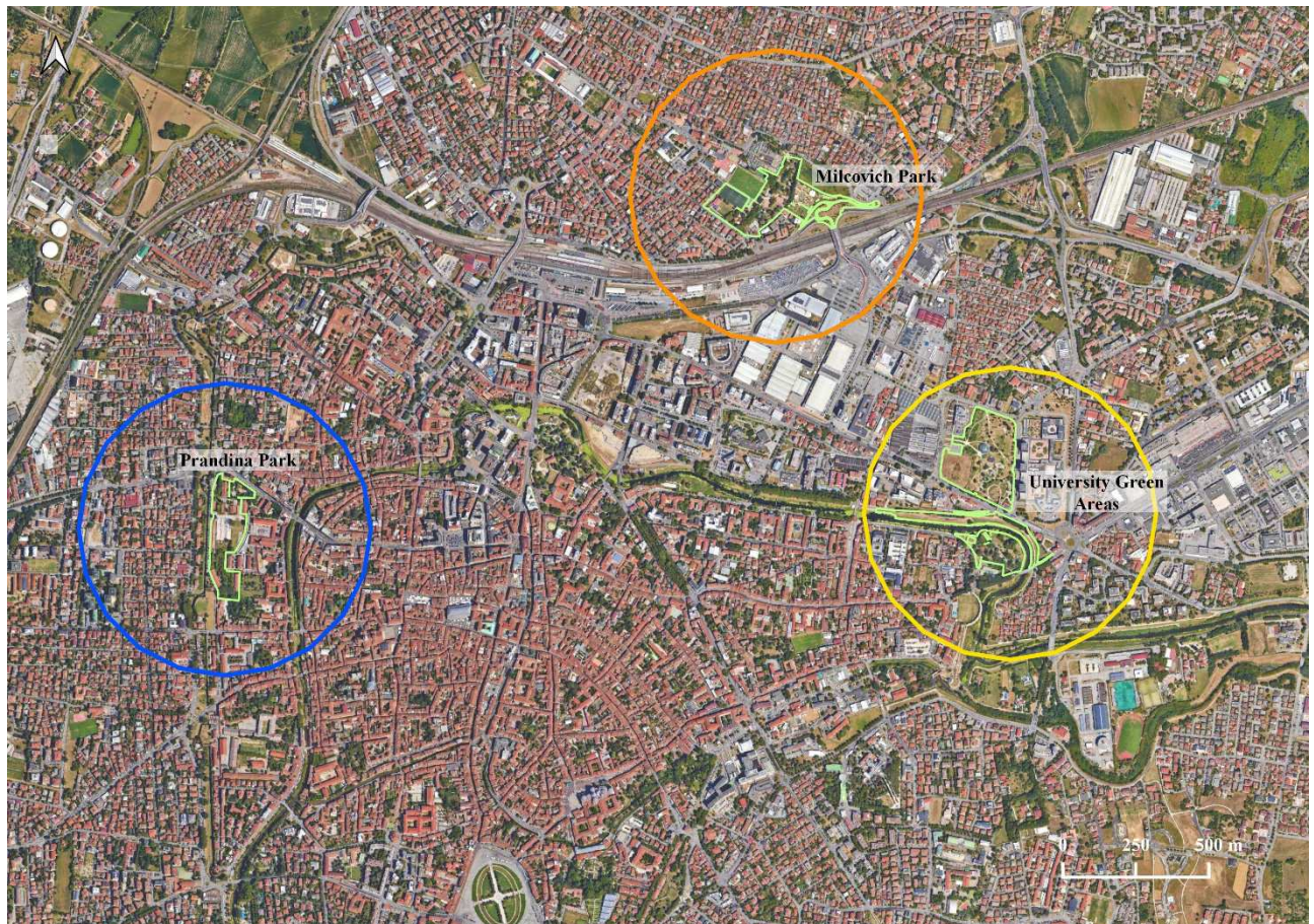
Fig. 2: Identification and geographical details of the three study cases selected for the PPGIS process

allows discussion on the basis of a direct contact with spaces, integrating the stimuli of all the human senses. During the participatory process, urban walks succeeded as a way to collect data from the ground and as a method for the participants to elaborate and share their ideas. Notably, the two processes became intertwined, resulting in data collection that evolved and changed according to the proposals of the participants while they took part in the construction of the same proposal.