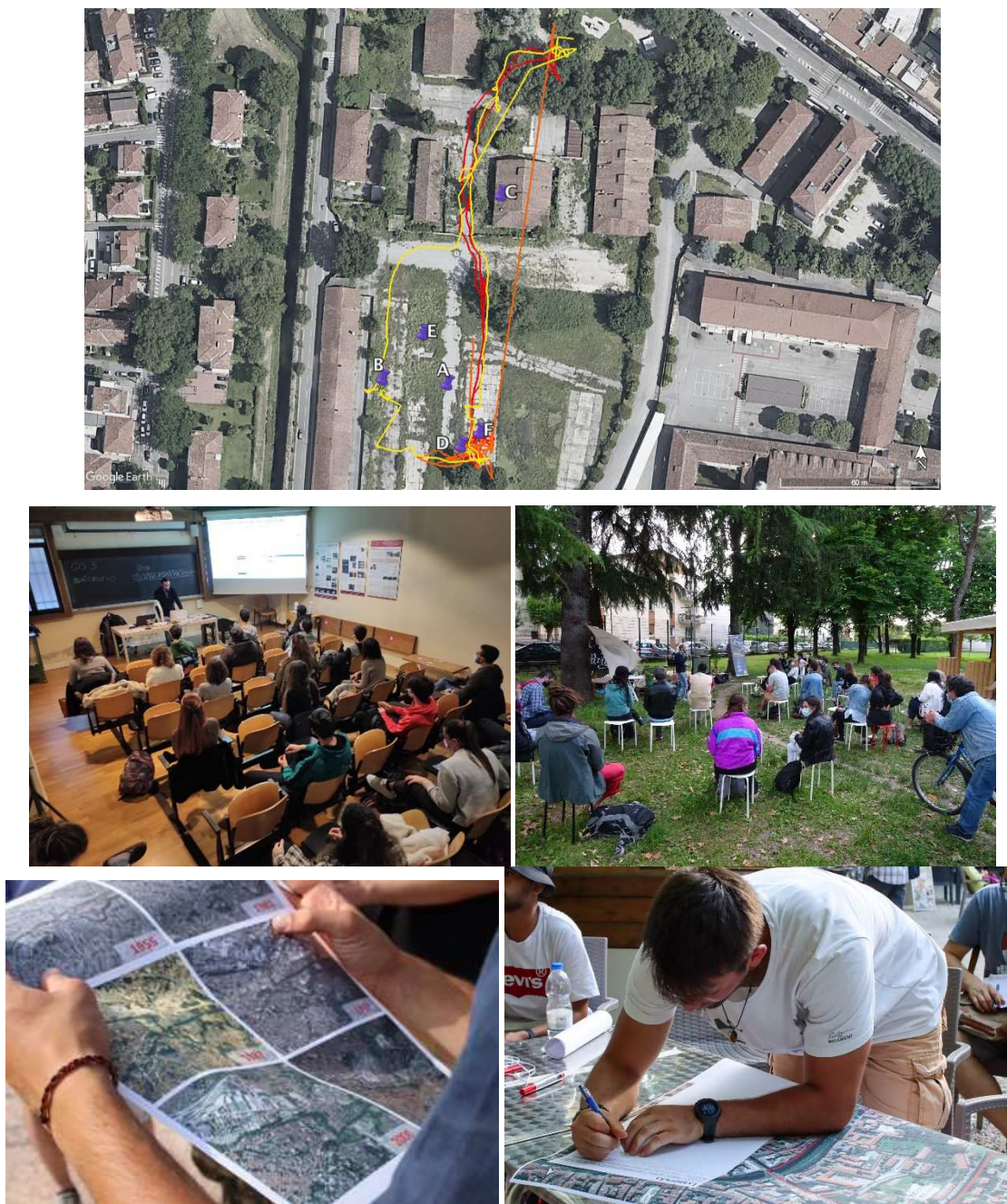
Fig.4: The photos show some examples of data collection using Geopaparazzi and Google Earth Pro for the visualisation and the PPGIS activities

The first urban walk was performed in the Portello neighborhood within the university green areas. During the urban walk, the two parks closed to the university green spaces, the Parco Europa and Parco Venturini-Natali, were also crossed and surveyed. The proposals mapped by the young people during this activity mainly concerned the regeneration of the infrastructures and abandoned areas along the urban walk. In addition, a restoration of the Piovego canal banks was proposed with naturalistic dissemination paths presenting the flora and fauna. In addition, the possibility was proposed of transforming the area during the spring and summer seasons into a study area with the installation of temporary structures such as geodesic domes to encourage outdoor teaching activities.