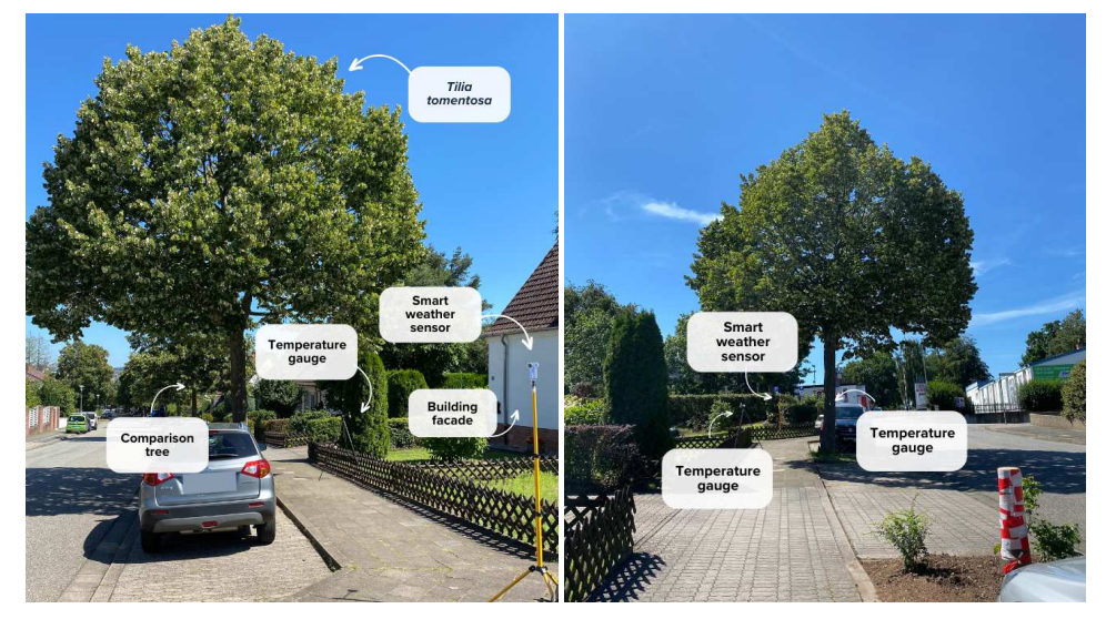
Figure 5: Insights into the setup at one of the locations; Buchenlochstraße, Kaiserslautern on 11 August 2023 [Geib 2023].

Close-ups of the leaves in the canopy are also used to record the rate and duration of leaf rotation to classify the temporal dimension [Geib & Henninger 2023, p. 44].