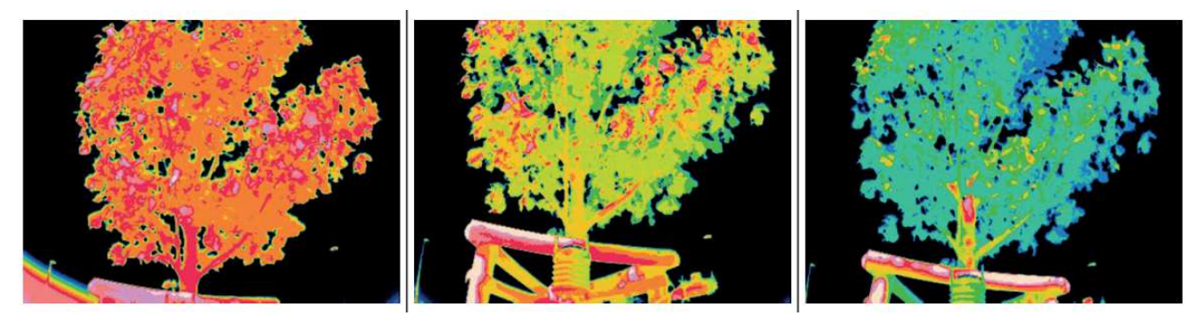
Figure 2: Thermal imaging camera images before rotation (left), during rotation (centre), and after rotation (right). High surface temperatures are represented by red-coloured areas and lower surface temperatures by blue areas [Henninger 2020, p. 76].

The leaves of the silver lime are initially covered with star-shaped hairs on the upper side but often become completely bare later [Binder 2015, p. 23]. The underside of the leaves has a dense layer of star-shaped hairs, giving them a silvery appearance, and sunken stomata [Böll et al. 2021, p. 5; Binder 2015, p. 23]. This hairy layer prevents aphid infestation and honeydew, while also protecting against heat and excessive evaporation [Roloff 2013, p. 159]. When exposed to extreme heat, the silver lime tree turns its leaves so that the lighter underside faces upwards, reflecting the incoming solar radiation. The change in albedo reduces the surface temperature of the canopy (refer to Fig. 2) as well as the air temperature under the canopy and around the trunk area [Henninger 2020, p. 76].