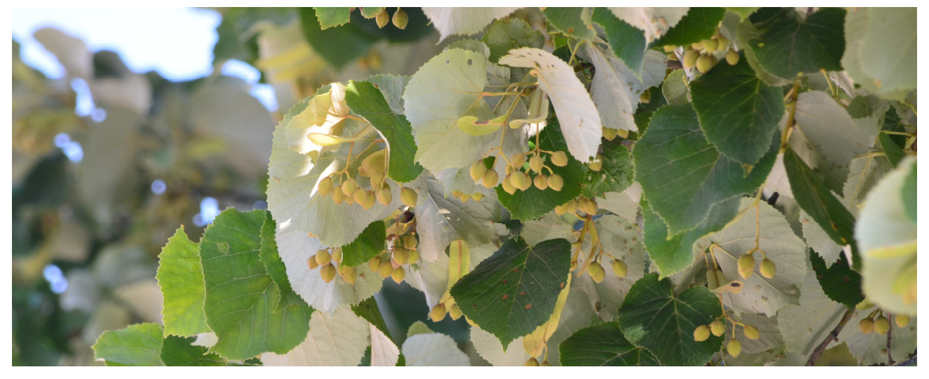
Figure 1: Photograph depicting the leaves of a silver lime tree located in Kaiserslautern, Buchenlochstraße, on 22 August 2023. The photograph shows the contrast between the dark green upper side and the light, silvery underside of the leaves [Geib 2023].

(Tilia cordata). This is probably due to its silver-haired leaves (refer to Fig. 1) and the ability to actively turn its leaves in hot weather (refer to Fig. 2). As a result, the silver lime tree is less likely to exceed critical temperature thresholds compared to the small-leaved lime tree [Schönfeld 2022, pp. 2-6]. Therefore, Tilia tomentosa is classified as highly suitable for drought tolerance and suitable for cold hardiness [Roloff 2013, pp. 176-182].