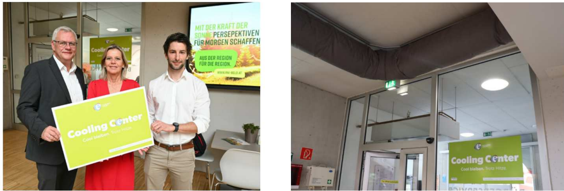
Figure 2: Left: Opening Ceremony of the Cooling Center, right: Distribution of the cool air via textile ducts

perforated, allowing the air to flow out evenly at a slow velocity. These enable pleasant cooling, while simultaneously reducing operating costs. Moreover, the Cooling Center should also become a social meeting place, where the energy transition in Eisenstadt is being driven forward together with the inhabitants.