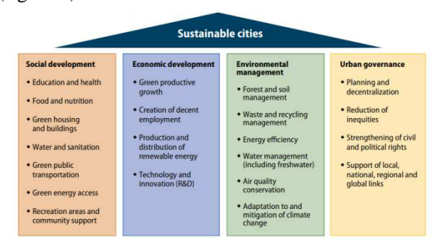
Figure 3: Pillars for achieving sustainability of cities.

These important structural transformations not only require integrated industrial ecological systems to manage and recycle liquid, solid and gaseous waste, while also requiring cultural shifts in consumption patterns, transportation and entertainment. For example, sustainable cities are characterized by a (relatively) compact fabric in order to reduce the travel distances between work, housing and services, and thus reduce energy use in transportation, and thus requires planning land uses in a way that enhances these perceptions (Monga, 2020) as shown in (figure 3).