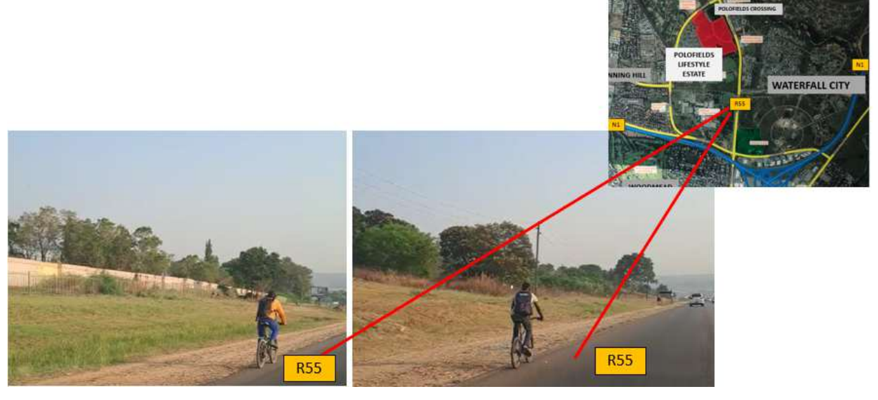
Figure 2: Depiction of workers cycling to work

The lack of taxi or minibus infrastructure provision in the area indicates this socioeconomic disparity, where communities in low-income areas are the ones serving the gated communities without real spatial, economic, and social integration. The development still embraces the same apartheid spatial landscape, which continues to promote disintegrating development continuity and sprawl, until inclusionary housing is built to help cities become more compact and integrated. Therefore, transportation facilitates access and mobility, and planners need to conceptualise the movement of people more comprehensively by taking into account the strategic importance of public transportation, particularly in new developments.