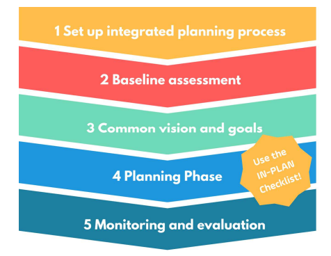
Fig. 2: Five phases of an integrated planning process according to the IN-PLAN Practice.

(5) Monitoring and evaluation of key performance indicators like emissions reduction, energy efficiency, and mobility improvements ensures adaptability. GIS mapping and digital tools support ongoing assessment,