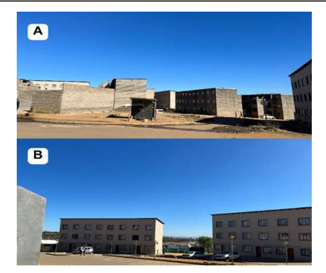
Figure 2: Illegally occupied housing project of 919 flats in Ext 36 in Olievenhoutbosch.

Picture A shows flats that were completely done, had streetlights, parking, water, and electricity, and were legally occupied by their rightful owners. Picture B shows flats that were illegally occupied by residents and were not yet completed.