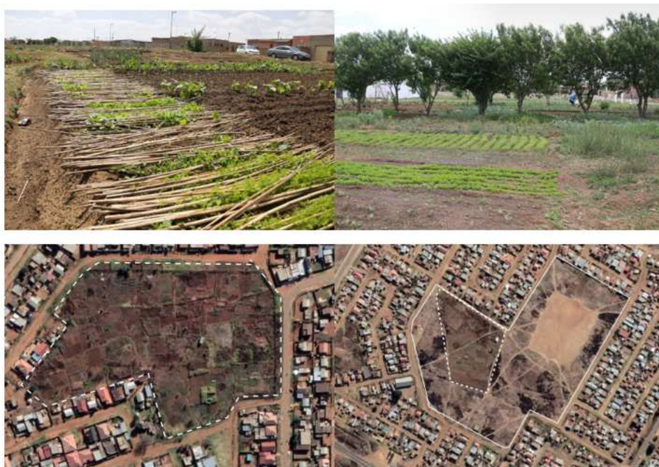
Fig 3. Samples of formalised agricultural activities