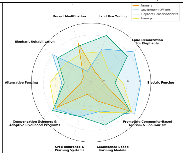
Fig. 3: Stakeholder preference distribution across strategy families (coexistence, partial separation, full separation), summarised by stakeholder group and used to parameterise utility-based scenario comparison.

Equally important is the shift from purely expert-led weighting of criteria towards a game-theoretic, negotiation-centred approach to stakeholder-driven weighting. LUCIS has proven powerful for conflict identification, but in many applications, weights and priorities remain largely in the hands of experts or single institutions. In contrast, this study combines initial AHP-derived weights with an explicit game-theoretic layer, where alternative scenarios – coexistence, partial separation, full separation – are evaluated as strategic options with utilities for farmers, conservationists, and state agencies. Through this, weighting is no longer a hidden technical step: it becomes contested, negotiated, and iteratively adjusted until more stable, Pareto-efficient outcomes emerge. This responds directly to the discourse on whether digital tools and AI truly revolutionise planning: here, technology is not the driver of decisions but an enabler of more transparent bargaining over space, risk, and heritage.