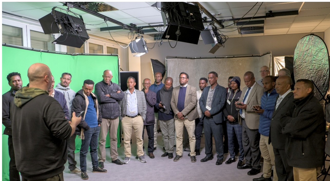
Fig. 4: Presentation at the Social Media Office of the University of Agriculture in Krakow.

The workshop also provided hands-on experience in the creation of small learning units consisting of different parts like introductory material, literature, educational videos, self-assessment tests, exercises, etc. These units were kept small so they could be easily reused, e.g., for LLL or whenever the curriculum needs to be restructured.