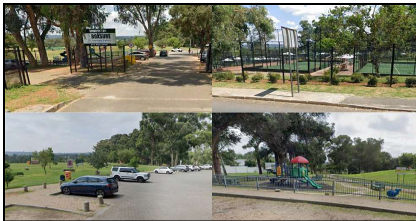
Figure 3: A Cross Section of the Scenery at the James & Ethel Gray Park.

The assessment of satellite imagery in Figure 2 showed that the park occupies an area of about 467,819m 2 , making it one of the biggest parks in the city. This wide area enables the park to incorporate many recreational sports, such as golf, long tennis courts, etc. Furthermore, the image showed significant vegetation coverage, creating lushness not only in the parks, but also in the neighbourhood. Vegetation health assessment from satellite imagery showed vibrant green coloration across the park, indicating healthy, well-irrigated vegetation with tree canopy coverage exceeding 40% of the park area. In complementing these, images combined in Figure 3 showed available facilities for enhancing the comfort of the park users, such as car parking, clear boundaries, and without any indication of encroachment.