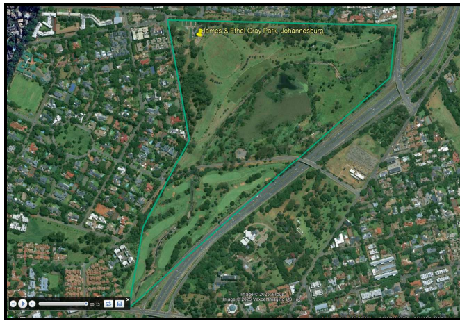
Figure 2: An Aerial view of James & Ethel Gray Park and its neighbourhood.