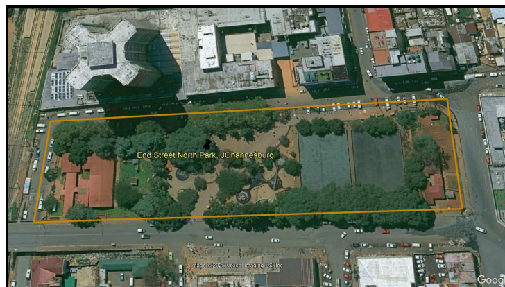
Figure 5: A close look at the End Street North Park.

The satellite image showed that the park occupies a relatively small land area of 14,366m 2 , and within this space, two municipal buildings are positioned on either side of the park. From a spatial justice perspective, this park's condition demonstrates what Buchholz (2011) identifies as 'unjust geographies': the park is maintained for reputation rather than residents' welfare, representing a form of procedural injustice where maintenance decisions are driven by the municipality's image management rather than the recreational needs of the surrounding community. This performative maintenance, cleaning for visibility rather than function, illustrates a superficial compliance with EJ distributive norms that masks procedural and recognition failures.