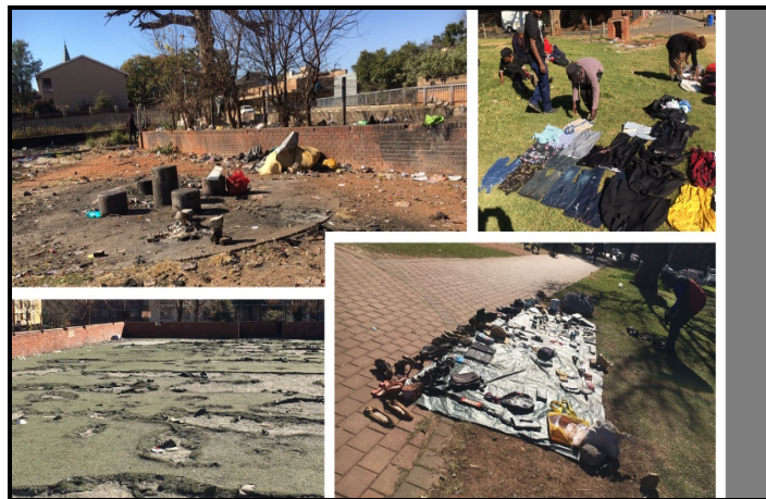
Figure 8: A Cross Section of the Scenery at the Doris Park, Johannesburg.

An assessment of the satellite image indicated that the park occupies 12,636m 2 of land. It is in a low-income neighbourhood, populated mostly by foreigners. The community streets were littered with waste, dilapidated houses, and evidence of street dwellings. Satellite imagery shows vegetation present, but with irregular distribution and evidence of stress. This pattern resonates with Shackleton and Gwedla's (2021) observation that vegetation stress is disproportionately concentrated in historically disadvantaged neighbourhoods, a legacy of apartheid-era green infrastructure underprovision. The Doris Park case represents the most severe expression of recognition injustice: the community's needs are rendered invisible by municipal governance, and the park's informal appropriation by vulnerable populations is a symptom of deeper spatial exclusion rather than community agency. Addressing conditions at Doris Park therefore requires more than physical