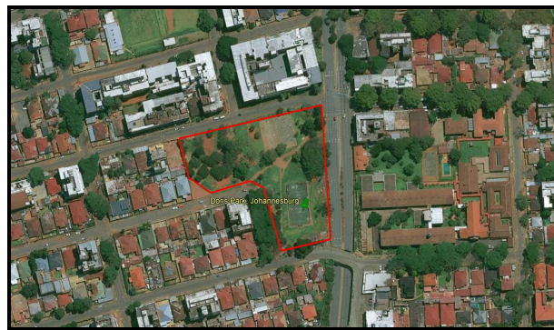
Figure 7: An Aerial view of Doris Park in its neighbourhood.

This park failed to attain any of the assessment indicators. Clearly, there is nothing that warrants maintaining at the park; rather, it requires a complete reconstruction. Lastly, the park environment is unsafe, given the concentration of informal economic activities and visible environmental contamination.