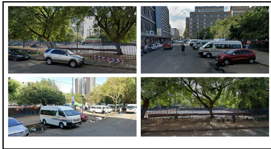
Figure 6: A Cross Section of the End Street North Park Scenery.

This park failed to attain any of the assessment indicators. Clearly, there is nothing that warrants maintaining at the park; rather, it requires a complete reconstruction. Lastly, the park environment is unsafe, given the concentration of informal economic activities and visible environmental contamination.