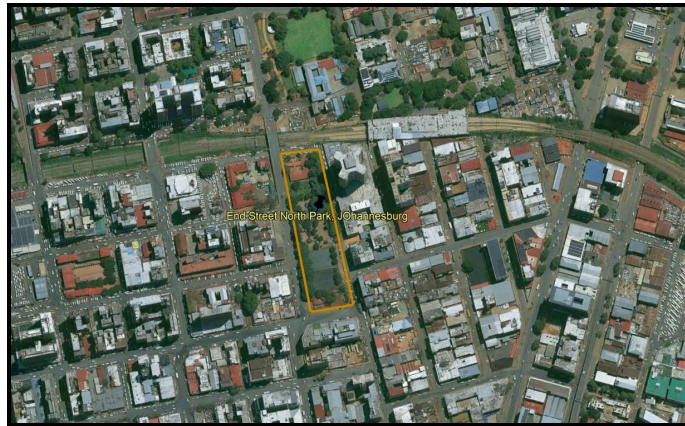
Figure 4: An Aerial view of End Street North Park, and its neighbourhood.

Given its location, adequate parking spaces are lacking, and the available spaces have been encroached by Taxis that have adopted the space (see Figure 6) as an informal park station. This limits the extent of the safety of cars belonging to park users. Going by the adopted indicators, the End Street North Park is limited in infrastructure, recreation amenities, and safety, even though it is well-maintained. It is because of these observations that the park is categorized as fairly maintained.