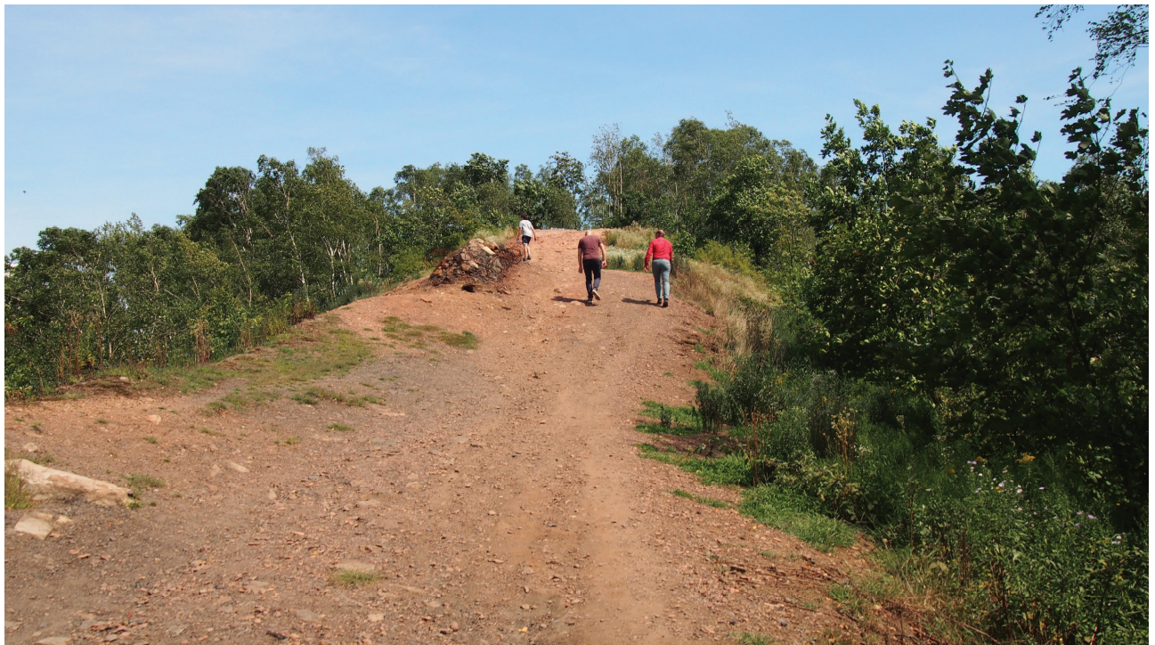
Fig.2 Burning mines heap Ema in Ostrava

Ostrava is the third largest city in the Czech Republic. It is a former industrial city with a polycentric settlement structure. In the territory of Ostrava, the project will be tested, among other things, the effects of burning mines heaps on the UrbClim model. (See Fig. 2) His ability to describe and evaluate these unique phenomena that are located in the urbanized area will be tested. It will be assessed if and how these thermal points affect the climate in the neighborhood and what changes would bring about their extinction.